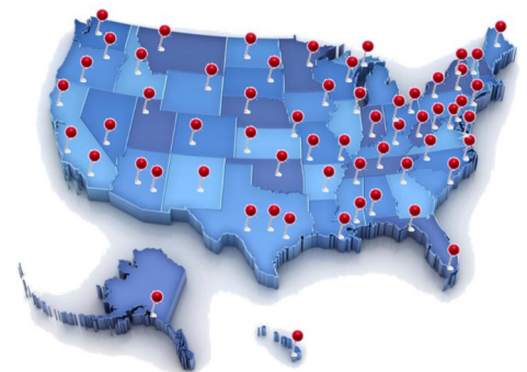
Deploying Technology Solutions to all 50 States