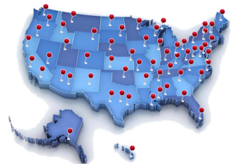
Deploying Technology Solutions to all 50 States

CONTACT US TODAY FOR DESIGN, BUILD, INSTALLATION, AND SUPPORT SERVICES: